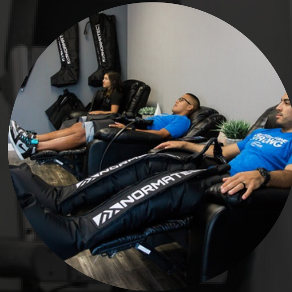
PT / RECOVERY LOUNGE