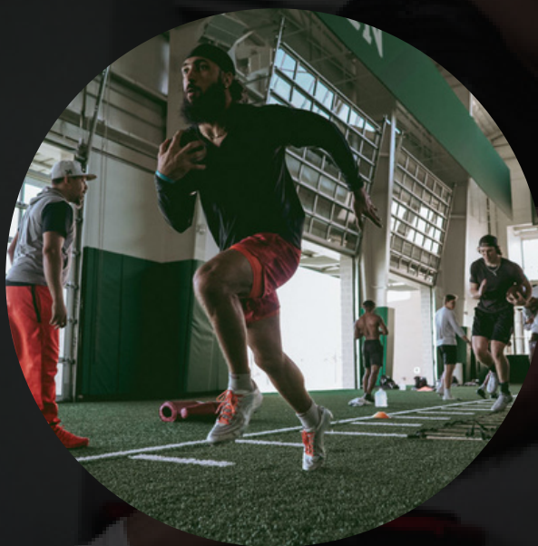
MOCK COMBINE TESTING