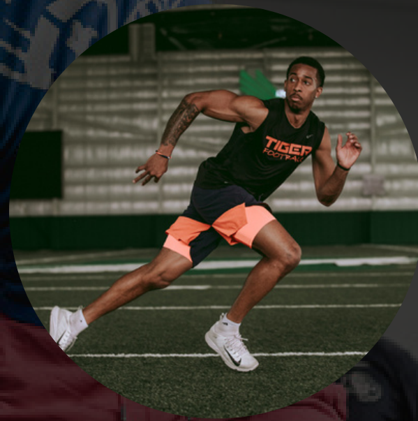
VIDEO MOTION ANALYSIS