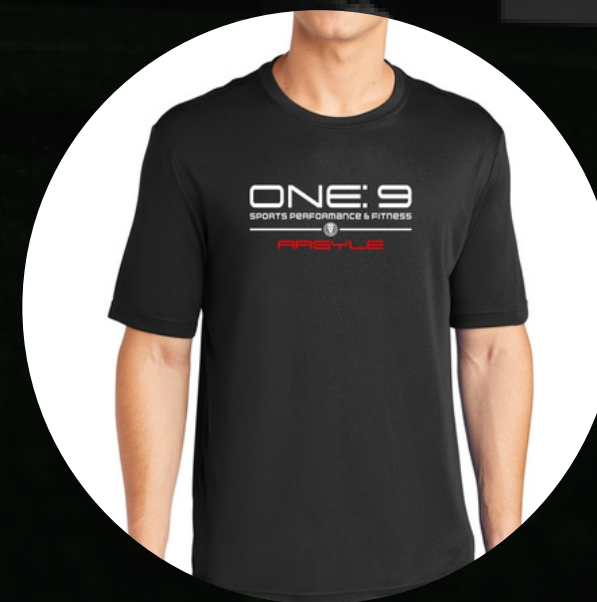
ONE:9 - ARGYLE APPAREL